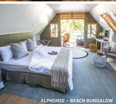
ALPHONSE - BEACH BUNGALOW