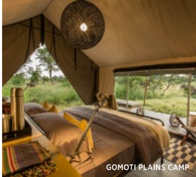
GOMOTI PLAINS CAMP