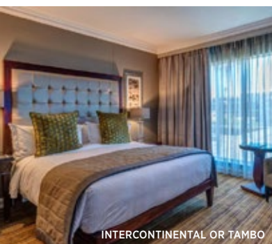
INTERCONTINENTAL OR TAMBO