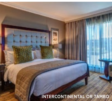
INTERCONTINENTAL OR TAMBO