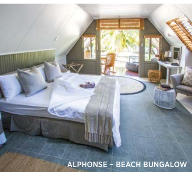
ALPHONSE - BEACH BUNGALOW