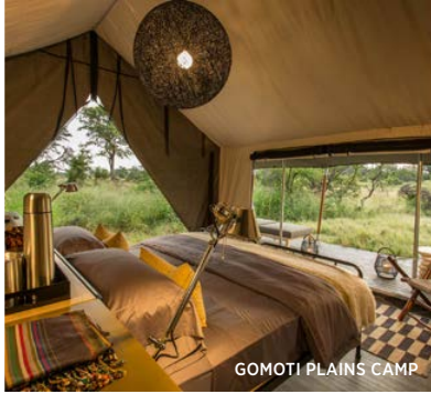
GOMOTI PLAINS CAMP