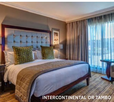
INTERCONTINENTAL OR TAMBO

Flights departing Maun arrive in Johannesburg too late for the connecting flight to Mahé, therefore guests to overnight in Johannesburg at Intercontinental OR Tambo on a B&B basis.